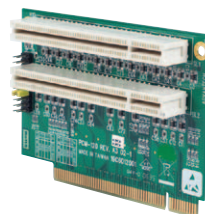
PCM-120 2-Slot PCI Riser Card for 5.25" Biscuit SBCs