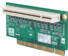
PCM-110 1-Slot PCI Riser Card for 5.25" Biscuit SBCs