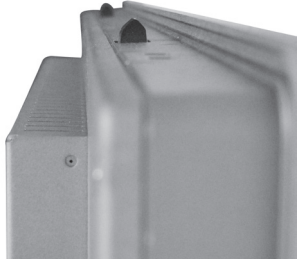
Screw to set up the snap hook out of upper side