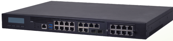
Images are for reference only. See ordering information for SKU details.

1U x86 Rackmount Network Appliance Powered by Intel® Core™/Pentium®/Celeron® Processors