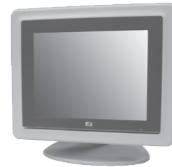
▲ Desktop stand