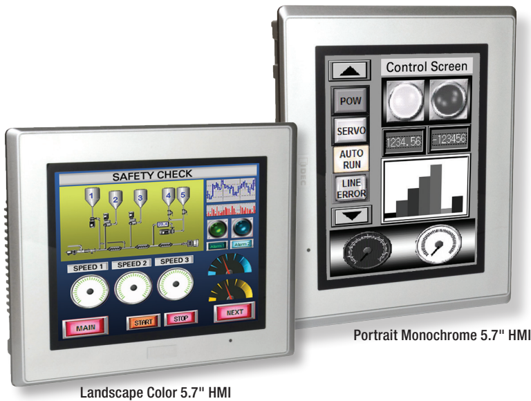
Landscape Color 5.7" HMI