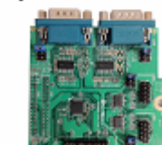
ADE4COMCB 4-port RS232 Serial