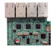
ADE4INLANG 4-port Intel LAN