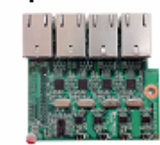
ADE4RTLANG 4-port Realtek LAN