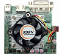
ADE4HV13M NVIDIA 610M GPU