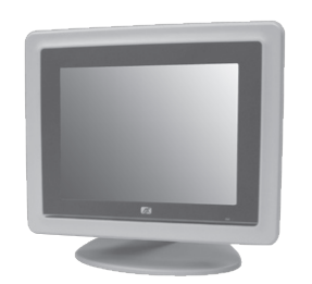
▲ Deskton stand