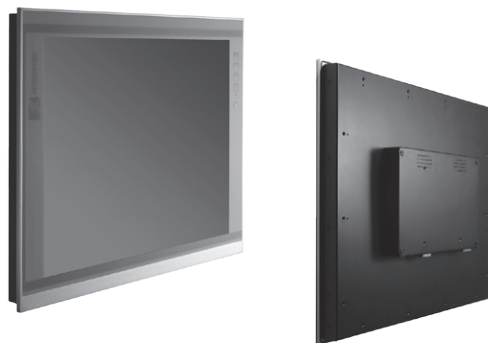
▲ Ultra-slim mechanism design