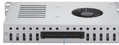
▲ Rear view