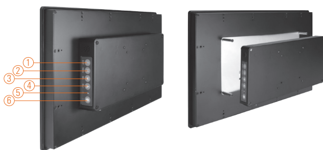
▲ Modularized design