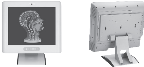
▲ Stand kit